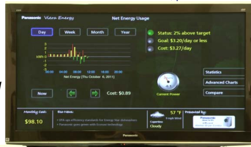
Real-time and historical energy plots with performance tracking