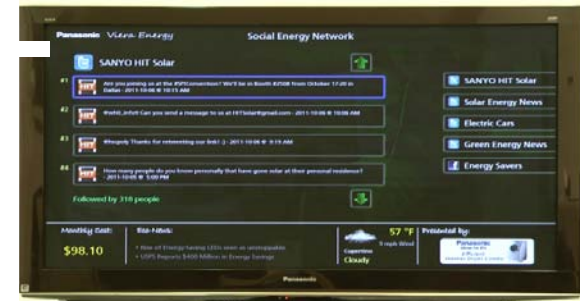
Energy-related services (e.g. Twitter & Facebook)