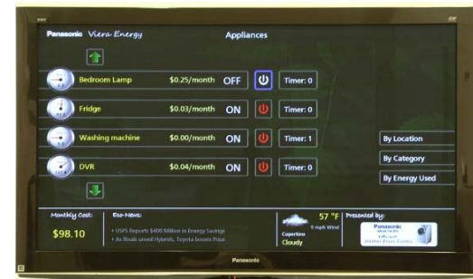
Appliance monitoring & control