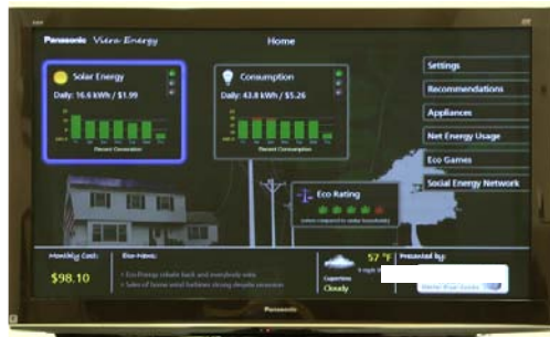
Customizable dashboard showing top-level information

VIERA Connect aggregates data from multiple sources (e.g. solar panels, appliances, car) and related services and provides an intuitive user interface.