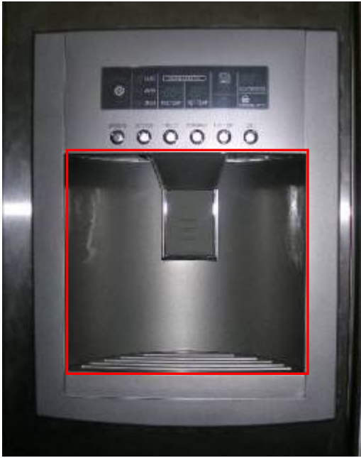
Figure 4-18 from AHAM HRF-1: 2004